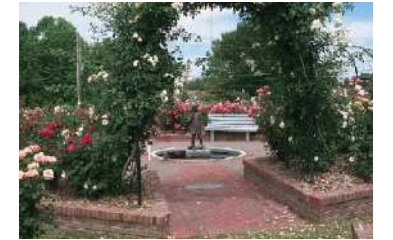
Wilson Model Area